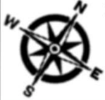
Red Gate Farms RV Resort Sit Map

136 Red Gate Farms Trail Savannah, GA 313405 Tel: 912-272-8028